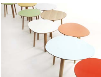
*original habitek works